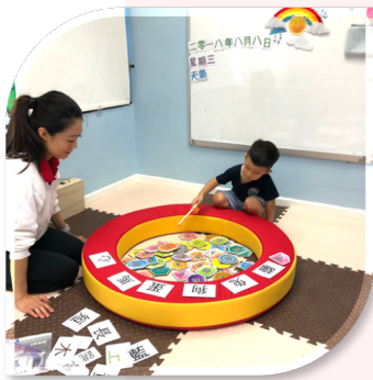
Learning the Chinese Character K1-K3

It is time for the kids to tell the story. The kids will learn to express themselves, share a story and present in front of their little peers. Allow the kids to talk in front of the audience and enhance their confidence.