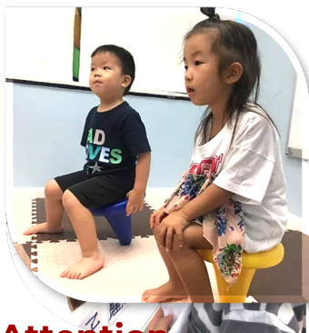
Attention Enhancement 20 - 36 months / K1-K3

Chinese character can be a difficult language to learn. It is even more difficult without an interactive and interesting way. Our course is again designed to let children to learn through lots of playing.