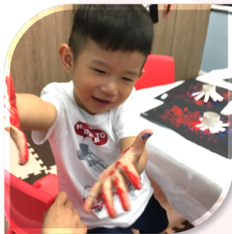
Little Pre-schooler 16-21 months

As your toddler start to take their first step in life, our course would include activities to develop their fine and gross motor skills which are designed base on the neuro development stage of toddler.