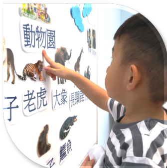
Pre-schooler 21 months - 3 years old

Getting the kids to prepare for a more structured school life. Aims at improving kids attention, social skills, expression skills and Linguistic skills through playing.