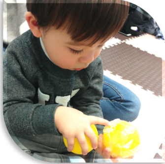
Toddler First Step 8-16 months

As your toddler start to take their first step in life, our course would include activities to develop their fine and gross motor skills which are designed base on the neuro development stage of toddler.