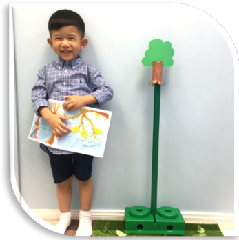
The Story Teller PN-K3

It is time for the kids to tell the story. The kids will learn to express themselves, share a story and present in front of their little peers. Allow the kids to talk in front of the audience and enhance their confidence.